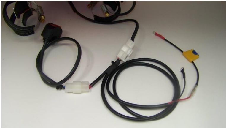
Baja Designs harness w/switch part# 64-0057

We recommend using Baja Designs harness w/switch part# 64-0057 which comes complete with a fused harness and handlebar mounted on/off switch.