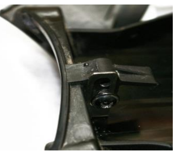
The photo below represents a proper installation, less your stock rubber straps.