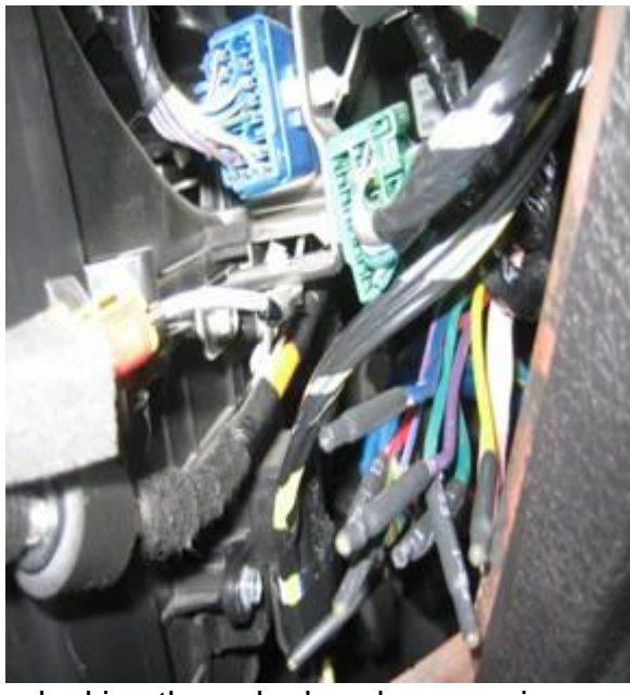
View looking through glove box opening