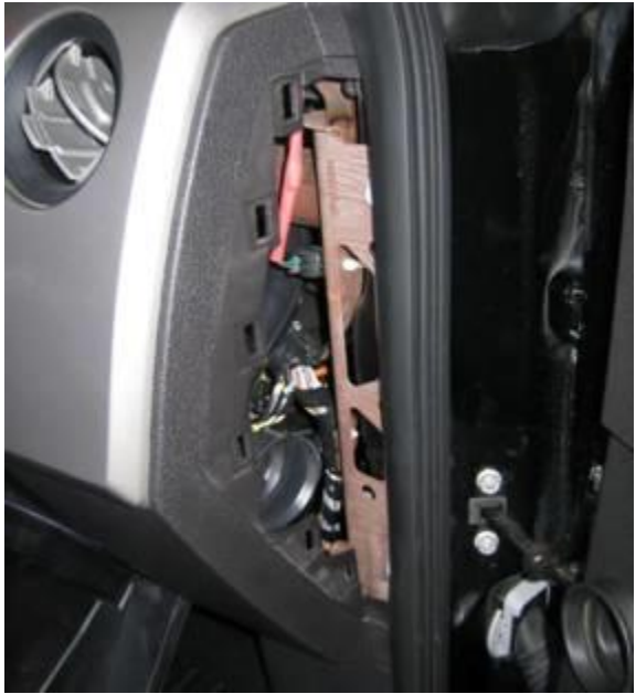
View of side panel removed to allow removal of glove box.

The circuits for each of the 4 factory switches, referred to as "upfitter" switches in your manual, are "open" as your Raptor is shipped from the factory. There are 4 wires that run from the switches to behind the glove box and end there. You can remove the end of the dash along with the glove box to access these wires.